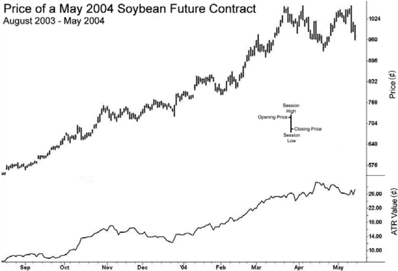
Chart 5.9: Chart Showing Soybean Daily Bars with Daily ATR.

Daily price chart of May 2004 Soybean Futures shows a smaller ATR at the beginning of the trend. A smaller ATR allows for more contracts to be traded via Turtle money-management rules. By the end of the trend, ATR has expanded greatly, reducing the size of the position you can have on.