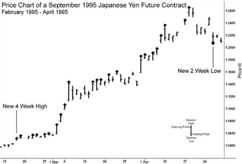
Chart 5.3: Turtle Entry Example Using Japanese Yen.

The September 1995 Japanese yen futures made a new four-week high on February 16, 1995. Turtles rules called for an entry on the next trading day. The position was held through all subsequent new highs and exited on a new two-week low on April 26, 1995.