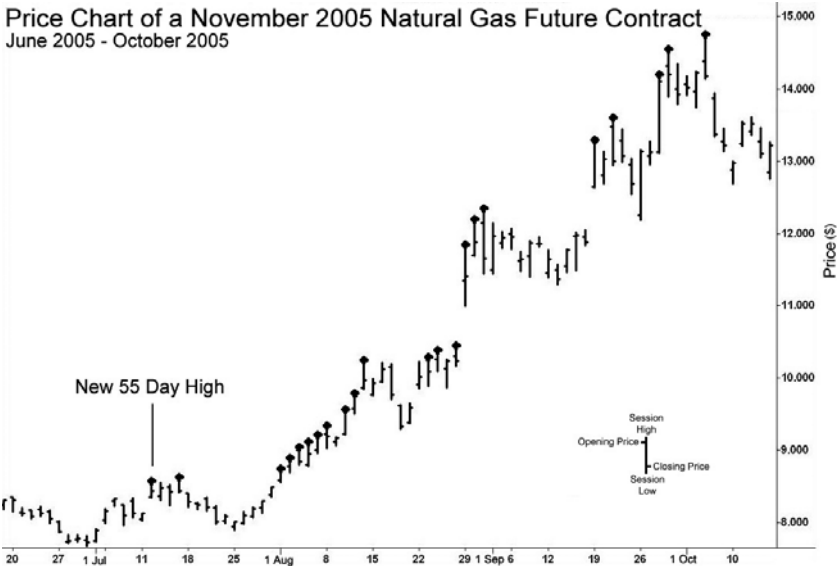
Chart 5.4: Turtle Long Entry Example Using Natural Gas.

A new fifty-five-day high was made in November 2005 Natural Gas on July 12, 2005. The market continued making new highs until a peak on October 5, 2005.